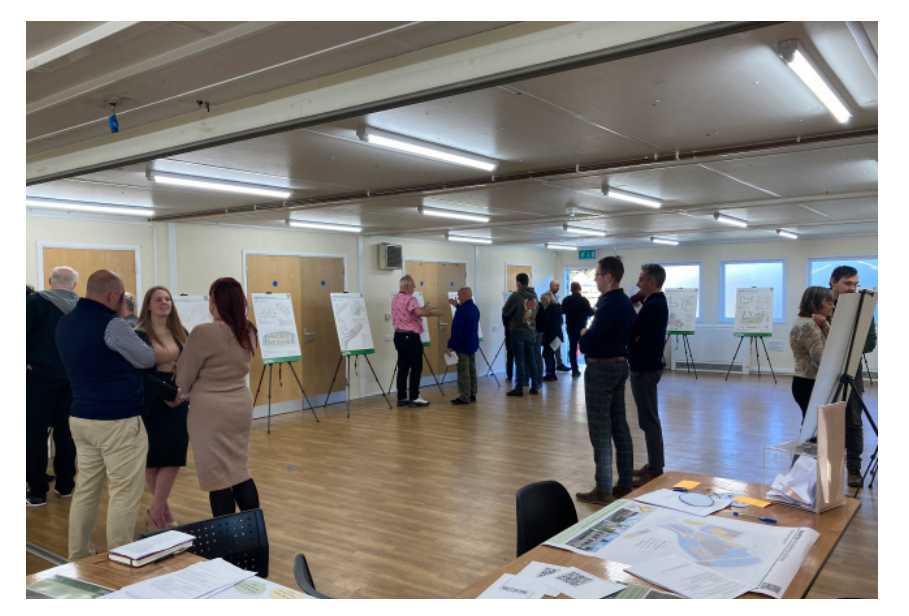
Holding consultations with the local community