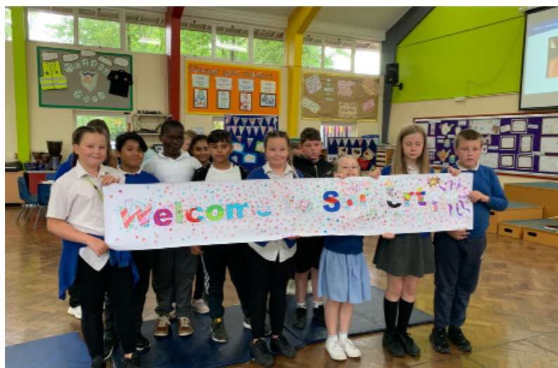
Visiting pupils at Somerton Primary School