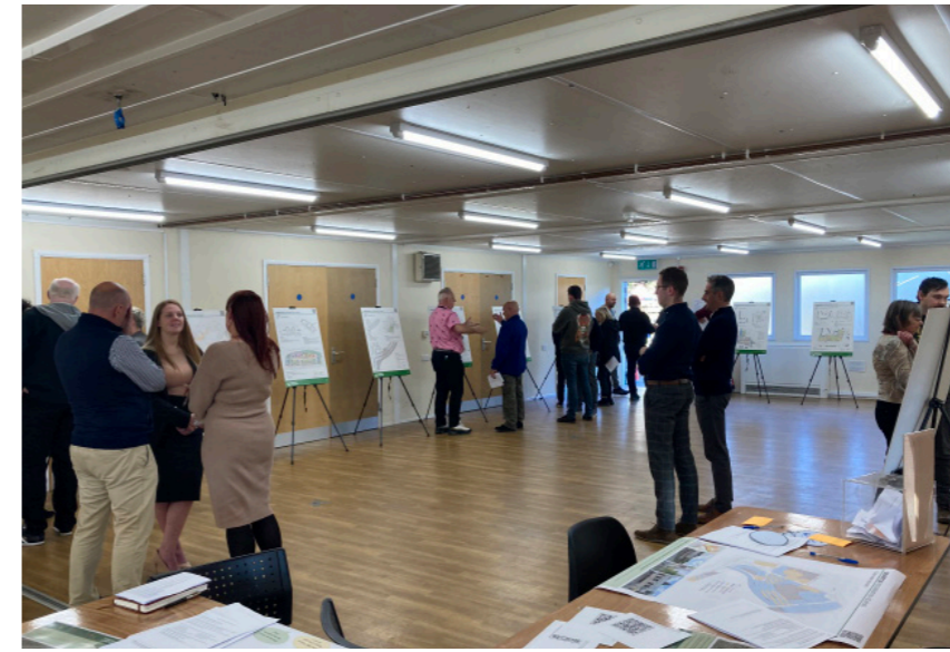
Holding consultations with the local community