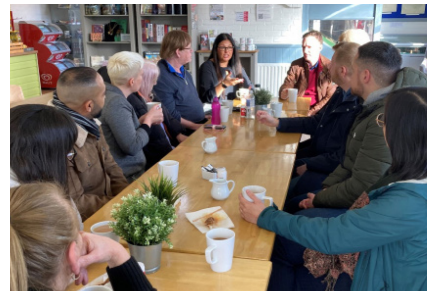
Exploring our options