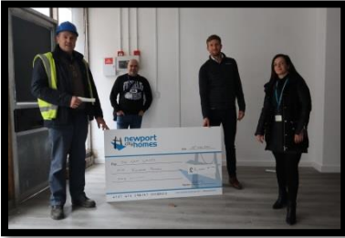
Presentation of cheques to The Gap Wales' new 'Bike hub' project, which supports sustainable transport in Newport and is soon to open its' new 'bike park' on Skinner Street. (see photo left)

We are continuing to engage with the local community, to fund some valuable projects within Newport. Umbra Building Services have previously donated to The Gap Wales , and Bethel Community Church . Next month we will be donating some additional funding to The Stow Hill Community Centre as part of our commitment to aid the local community.