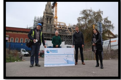
Presentation of cheques to Bethel Community Church has also been made, to aid them in providing homelessness and refugee aid locally on Stow Hill. (see photo right)

The project is jointly funded by Newport City Homes and the Welsh Government in order to provide affordable, safe, secure, highly efficient lifetime homes in Newport, for local people.