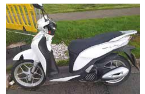
down on this anti-social behaviour and would urge anyone with information about any illegal off-road vehicles to call 101."

"We are working with the police and council to crack